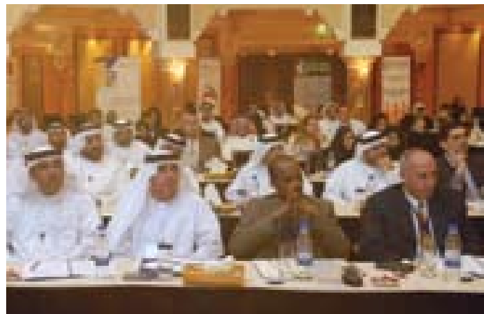
Delegates at the 3rd UAE Government Organizations Customer Care Excellence Conference held at the Burj Al Arab, Dubai, UAE.