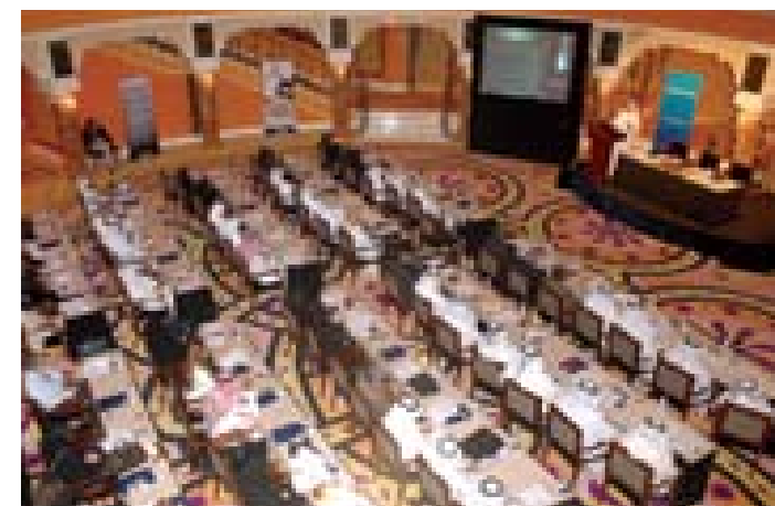
Participants at the UAE Government Organizations Customer Care Excellence Conference