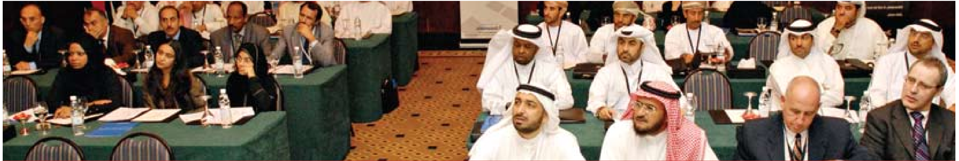
Learn how to respond to organizational pressures regarding outsourcing and consolidation and critically evaluate options