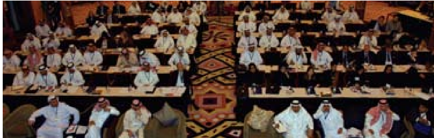
Based on the ever-changing business environment and demands of customers, the event provided the opportunity to learn, share best practices, and build relationships with the region's top customer care decision-makers, industry experts and professionals.