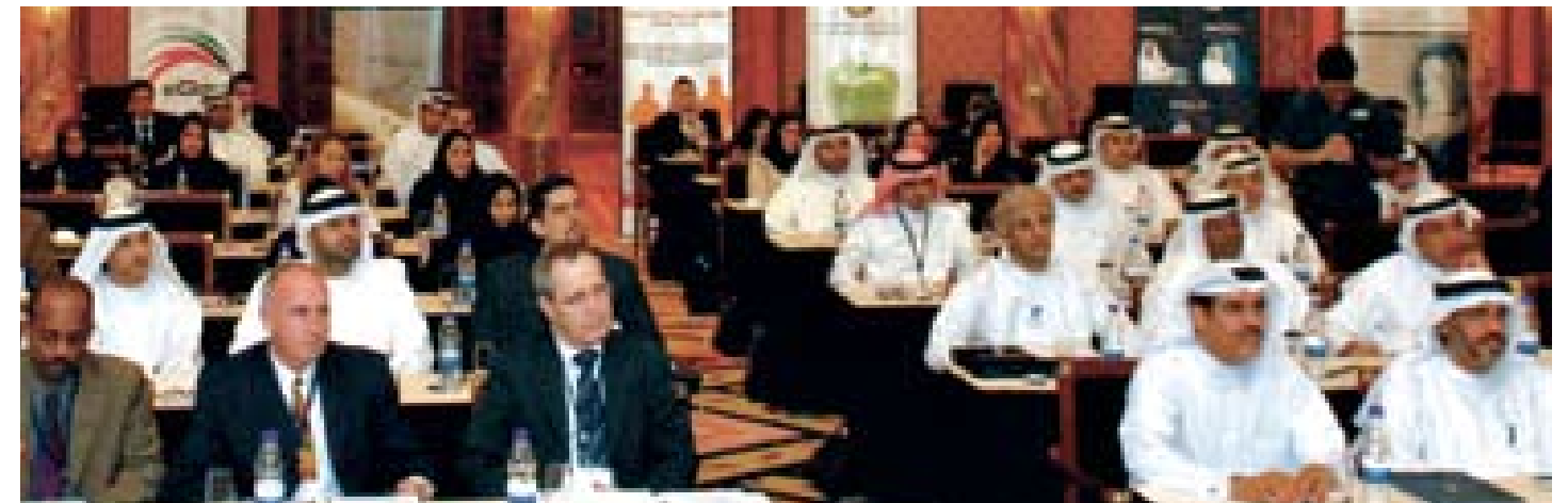
Government customer service and support managers at the UAE Government Customer Care Excellence and Leadership Conference