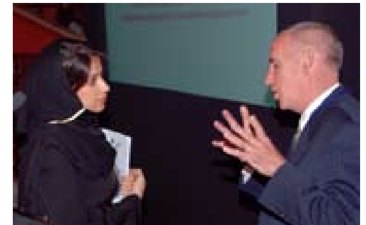
Discussion between speakers and delegates during the Customer Care Excellence Conference