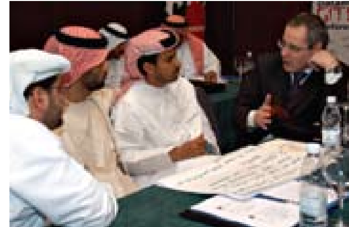
Group discussions held in a fun interactive format to determine what they should do to provide quality customer service