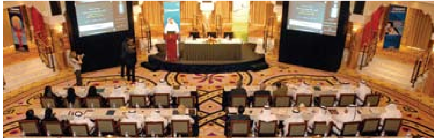
Speakers and delegates at the 3rd UAE Government Organizations Customer Care Excellence Conference at the Burj Al Arab, Dubai, UAE.