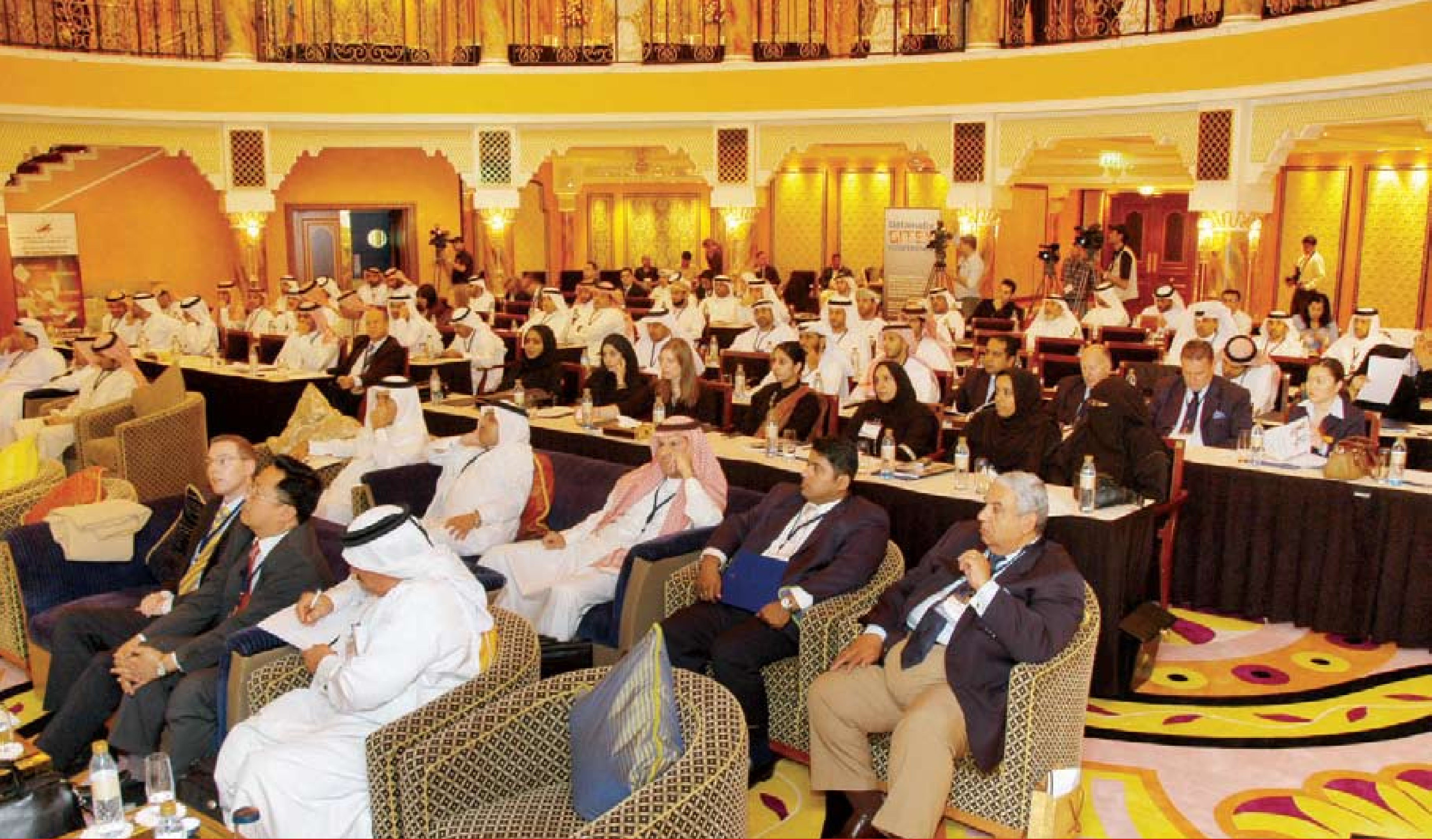
GCC GOVERNMENT CUSTOMER CARE CONFERENCE