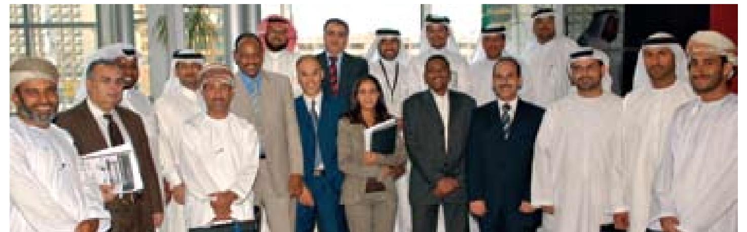
This conference was organized for Customer service staff in the GCC Government Sector who deal with internal or external customers face to face or by phone and customer service team managers or leaders responsible for customer service department.