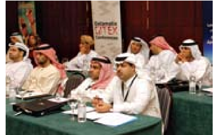
The conference focused on increasing customer satisfaction and the net impact of government customer service