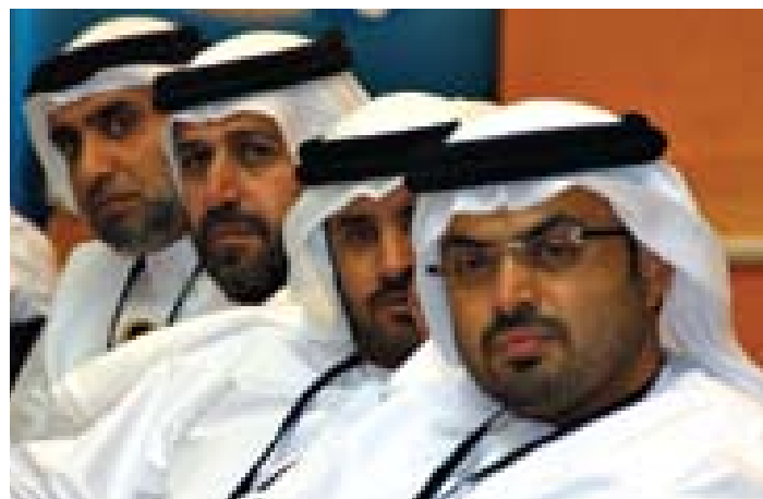
The event was attended by senior-level executives, decision-makers and professionals from the public and private customer care sectors